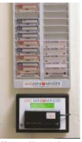
All you need in one package.