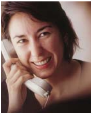
Helpdesk support whenever you need it.