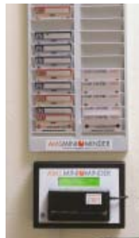
All you need in one package.